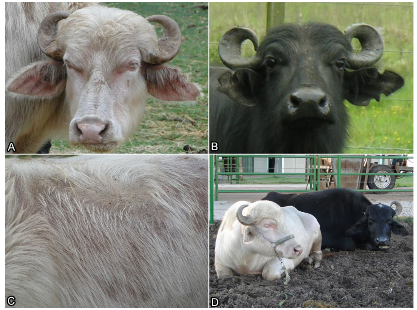
Fig.1 (A) Oculocutaneous albinism (OCA) Murrah buffalo, showing white skin and the stratum corneum of the horns; mucosa and periocular region (eyelashes, conjunctiva and iris) with absence of pigmentation. (B) Normal Murrah buffalo with black skin. (C) Depigmented skin and hairs of the dorsal region of an OCA buffalo. (D) An OCA albino bull and normal cow buffalo.

Experimental samples. For the present molecular study, hair, blood or semen samples were collected from 315 Murrah buffalo from Southern (states of Rio Grande do Sul and Paraná), Northern