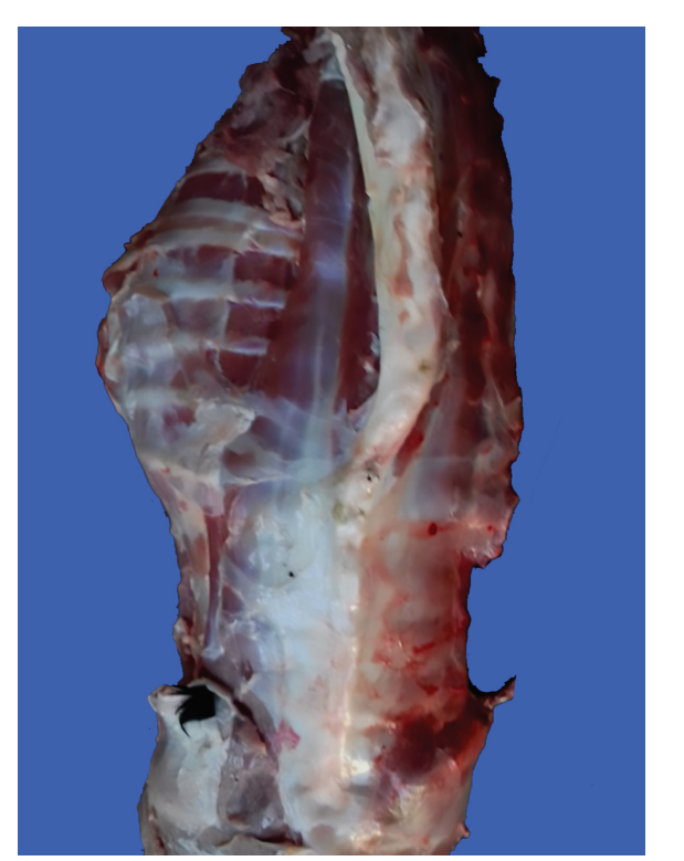
Fig.2. Experimental reproduction (Experiment stage 1). Scoliosis in the thoracic spine of a calf.