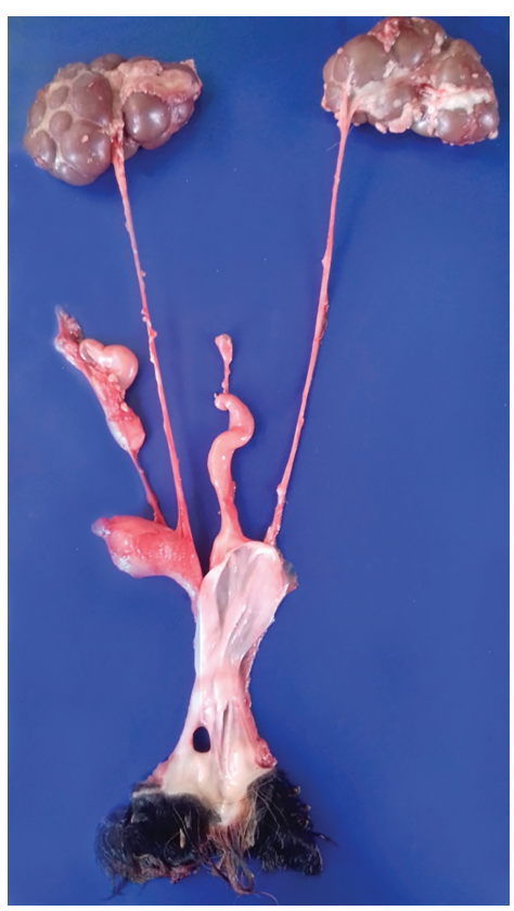
Fig.3. Experimental reproduction (Experiment stage 1). Urogenital tract of a calf showing deviation of the right ureter with blind ending and extending from the kidney to the cervix; the left uterine horn and ovary were inside the bladder neck.