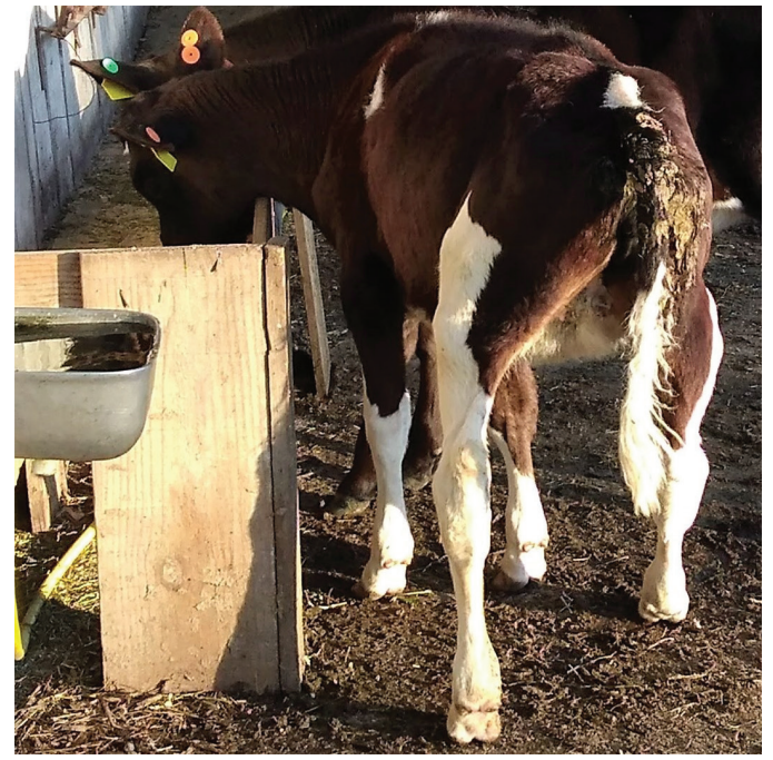
Fig.4. Experimental reproduction (Experiment stage 2). Calf with angular deformity of the pelvic limbs and moderate thickening of the joints.