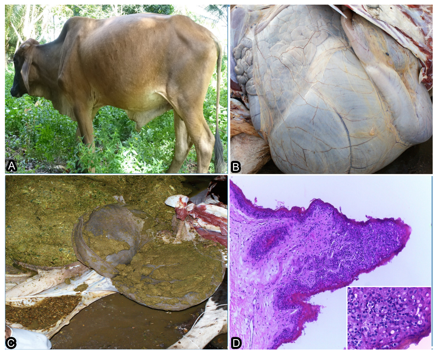
Fig.2. (A) Spontaneously poisoned cattle with severe tympanism. (B) Rumen, reticulum and abomasum show enlargement due to gas accumulation. (C) Dry and impacted rumen and reticulum contents and excessively liquid abomasum content. (D) Rumen mucosa presenting keratinocytes and epithelial necrosis with ballooning degeneration, lymphocytic and neutrophilic inflammatory infiltrate containing bacteria and abscesses. HE, obj.10x.

Necropsy findings in two spontaneously poisoned cattle were similar and consisted of tympanism (Fig.2B), blood vessels congestion and petechiae in the rumen serosa. Rumen, omasum and reticulum contents were dry and compacted and abomasum content was liquid (Fig.2C). Abomasal mucosa was hyperemic, with swollen folds and contained multiple ulcers with a maximum of 0.5cm in diameter. Cattle had epicardial petechiae and lung consolidation areas and edema in the pulmonary caudal lobes. Histologically, the main lesions consisted of acantholysis, ballooning degeneration of rumen and reticulum keratinocytes, sometimes with the formation of pustules and inflammatory infiltration of polymorphonuclear cells and lymphocytes in the epithelium and the submucosa had marked edema (Fig.2D-F). The abomasum mucosa showed multifocal areas of necrotic epithelium, severe neutrophilic and lymphocytic inflammatory infiltrate; edema, congestion and hemorrhage in the submucosa were also noted. Similar