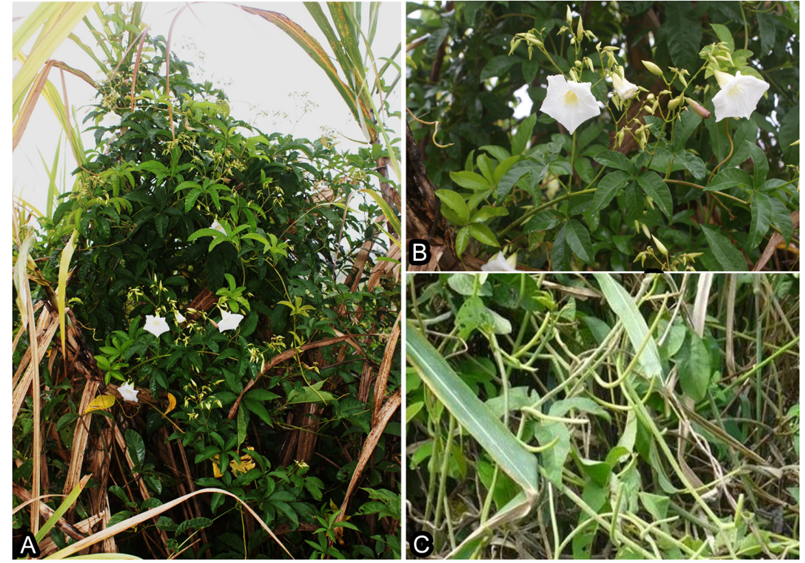
Fig.1. (A) Merremia macrocalyx in cattle grazing area. The plant is observed covering other shrubs, Condado, Pernambuco. (B) Leaves and flowers. (C) Merremia macrocalyx showing evidence of cattle consumption.