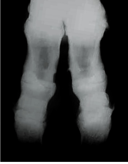
Fig.3. Plantar-dorsal radiography evidenced enthesophytes in the fetlock and distal interphalangeal joint of the medial and lateral foot, and in insertion of proximal interdigital cruciate ligament of medial foot.