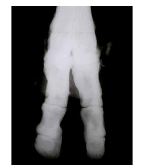
Fig.2. Plantar-dorsal radiography evidenced osteoperiostitis in the 3rd and 4th metatarsi of the left forelimb.