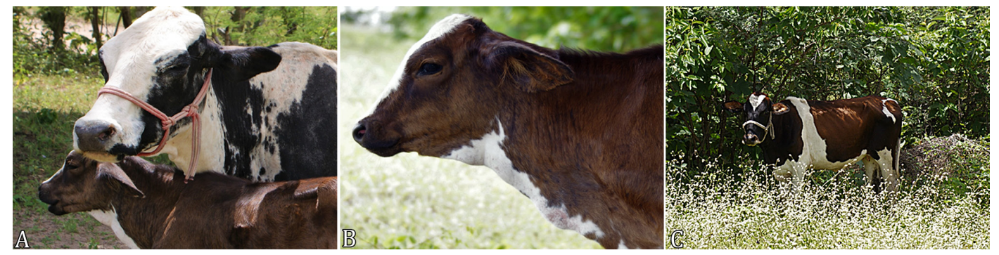
Fig.4. (A) Cutaneous lesions of Froelichia humboldtiana poisoning in the 8th day of experiment. Note the alopecia and hyperemia of depigmented areas of the skin near to the dorsal portion of the neck of the cow and (B) edema and alopecia of the calf barb. (C) Cow showing photophobia, remaining the most part of the day in a shaded area on the 3rd day of experimental poisoning.