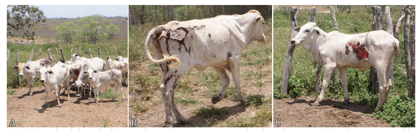
Fig.2. (A) Several cattle from a herd showing alopecia, ulcerative, necrotizing and exudative dermatitis, with loss of extensive areas of the epidermis, especially in the non-pigmented areas of skin in the (B) hindlimbs and (C) flanks.

After primary photosensitization diagnosis, all cattle have been removed from the pasture invaded by F. humboldtiana to a shaded facility with a supply of napier grass ( Pennisetum purpureum ). The cutaneous lesions of affected cattle in both outbreaks regressed in 10 days.