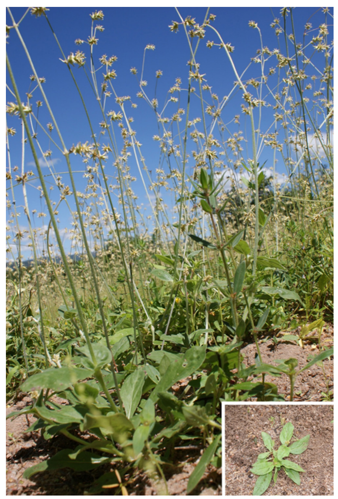
Fig.1. Froelichia humboldtiana , an erect or decumbent sub-bushes with 0.5-1.5m of high. Inset: F. humboldtiana sprout. Cachoeirinha/PE, August 2017.

Experimental poisoning. For the experiment the guides related to animal welfare and ethics were followed, as recommended by