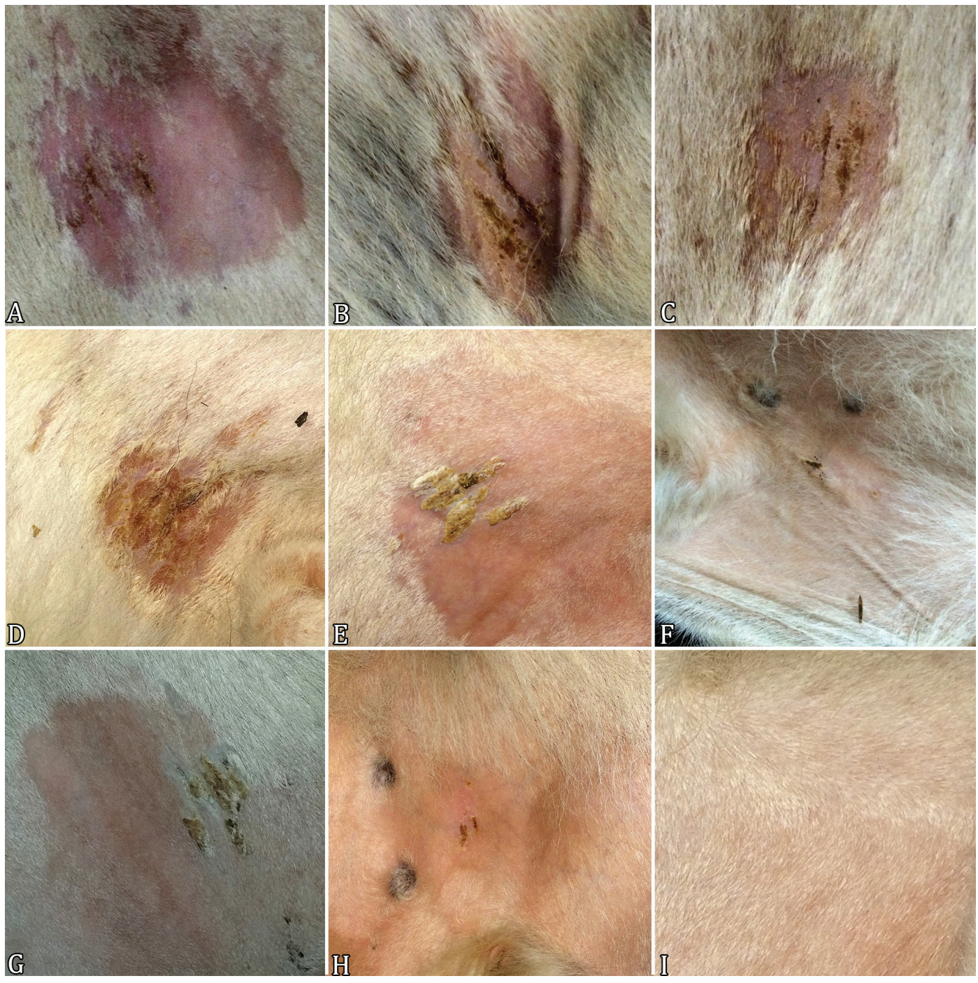
Fig 2. Skin lesions developed by calf 276 inoculated with (A, B, D, E, G, H) Bovine alphaherpesvirus 2 (BoHV-2) transdermally and (C, F, I) by a control calf inoculated with culture medium, at different days after virus inoculation. (A-B) 276 and (C) control. Days 2 and 4pi, respectively, thin scabs and skin retraction derived from scarification. (D-E) Days 6 and 8pi. Thick, yellowish scabs and small disrupted vesicles. (F) Control. Day 8pi. A thin scab, advanced stage of healing. (G-H) 276. Days 10 and 12pi. Crust remnants, advanced stage of healing. (I) Skin completely healed (control).