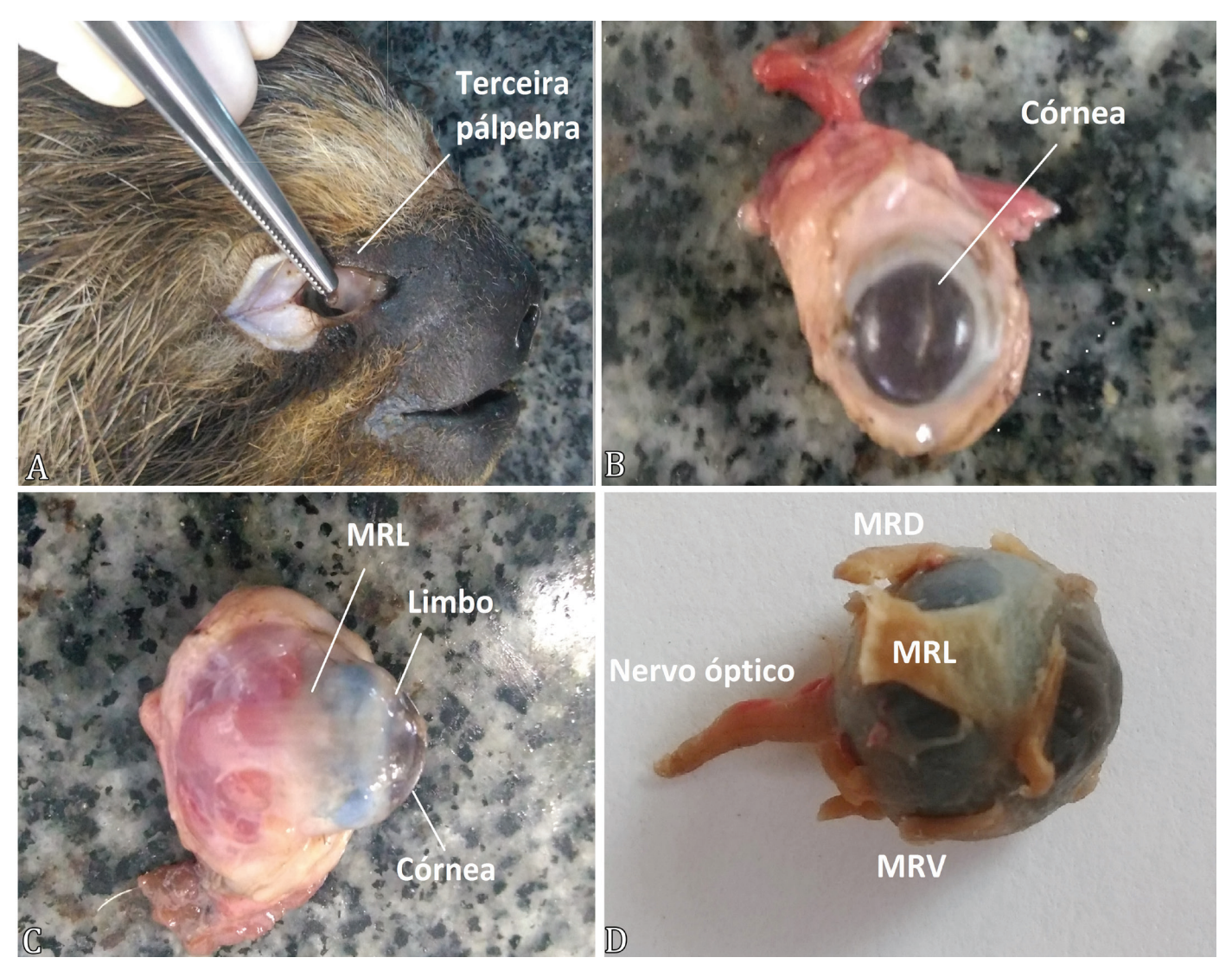
Fig.1. Sloth eye. (A) Traction of the third eyelid, (B) anterior view of the eyeball, (C) lateral view of the eyeball, immediately after enucleation, (D) side view of the eyeball. After dissection of the musculature. Lateral rectus muscle (LRM), dorsal rectus muscle (DRM), ventral rectus muscle (VRM).

After the posterior lens capsule, the vitreous chamber can be differentiated, filled by the vitreous body, a dense and slightly watery structure. This chamber has an average of 5.0\pm0.81 mm in length. The retina-choroid-sclera complex (RCSC) forms the posterior wall of the eyeball. This region is