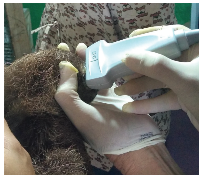
Fig.2. Performing an ocular B-mode ultrasonography in Bradypus variegatus.

IOP = Intraocular pressure, RE = right eye, LE = left eye, SD = standard deviation.