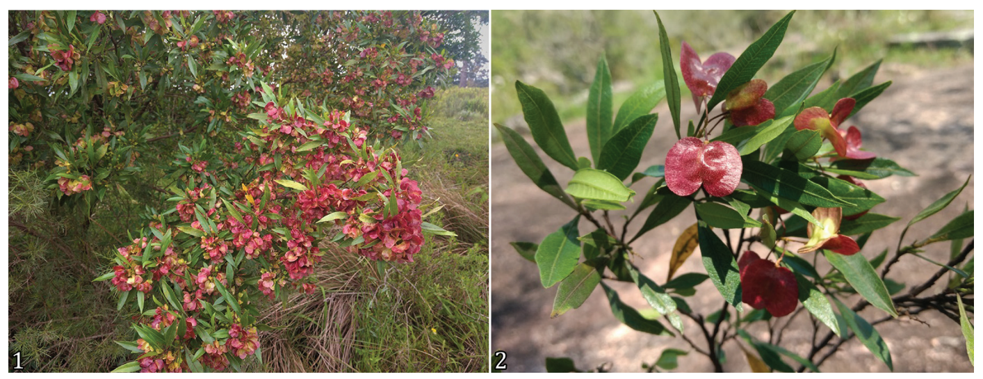
Fig.1-2. Exemplary of Dodonea viscose located in the municipality of Capão do Leão (31°74′88.25″ S, 52°54′32.11″ W). (1) Large shrub of D. viscosa approximately 2m tall in fruiting. (2) Detail of simple and alternate leaves with fruits with three to four wings.

Serosanguineous fluid was observed in the abdominal cavity during necropsy of the three affected cattle. The intestines presented a congested serous with marked edema of the mesentery (Fig.3), and there was hemorrhagic content in the lumen of the small intestine. The mucosa of the abomasum of the two animals was hemorrhagic with bloody content (Fig.4). Amid the ruminal content of the bovine, leaves with morphological characteristics compatible with D. viscosa were observed. The livers of the three animals were enlarged, with accentuation of the lobular pattern, and the gallbladder was