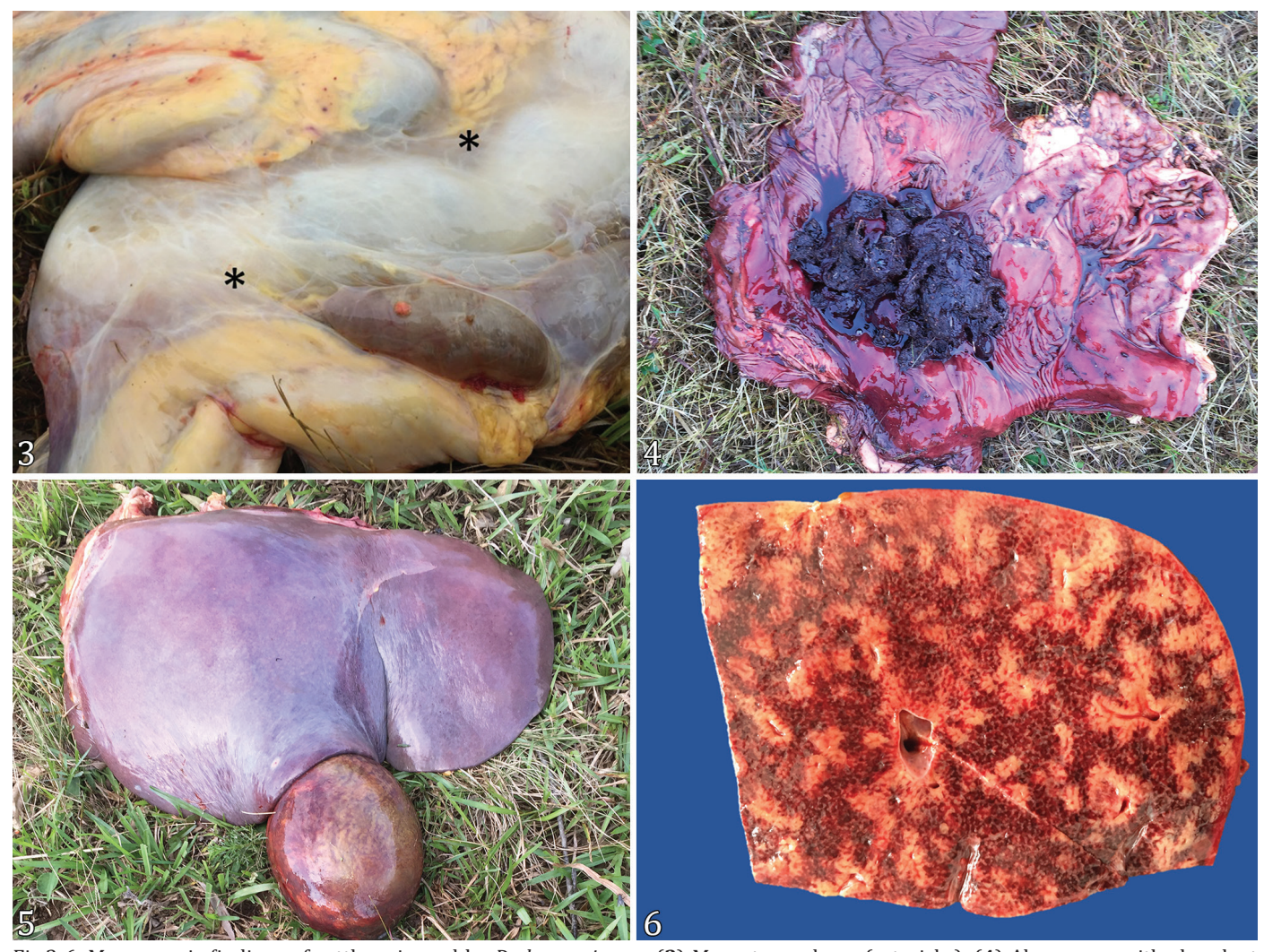
Fig.3-6. Macroscopic findings of cattle poisoned by Dodonea viscosa . (3) Mesentery edema (asterisks). (4) Abomasum with abundant bloody material and hemorrhagic mucosa. (5) Mild diffuse hepatomegaly and increased gallbladder volume. (6) Hepatic surface with accentuated lobular pattern, characterized by dark red areas interspersed with lighter areas.

Epidemiological data on toxicity of the plant are scarce, as cases of spontaneous poisoning have been described (Colodel et al. 2003) in cattle. In a study carried out in rats (higher dose of 1250 mg/kg), there were no signs of acute toxicity by D. viscosa (Arun & Asha 2008). Cattani et al. (2004) demonstrated that the leaves of D. viscosa were toxic to cattle during budding (June), inflorescence (September/October), and dry stages. The present case occurred in April, considering the flowering period of D. viscosa (Carvalho 2014); moreover, the leaves of D. viscosa were toxic at different phases.