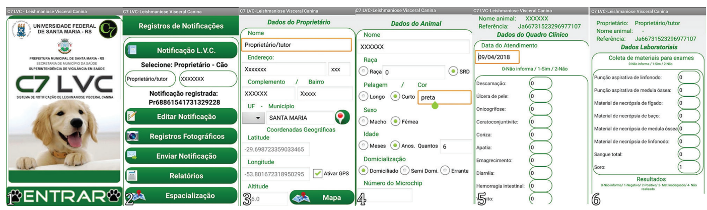
Fig.1-6. (1) App access screen seen on the user's smartphone. Initial interface of the C7 LVC App. (2) App's home menu. (3) Interface for filling in and/or accessing changes and records of owner data. (4) Interface for filling in and/or accessing animal data. (5) App interface for filling out clinical data. (6) App interface for filling in Laboratory Data.

Upon filling out the notification using the App, the user will be able to click on the "Laboratory data" button. In this menu (Fig.6), collections of materials for exams will be informed: lymph node aspiration, bone marrow aspiration, liver necropsy