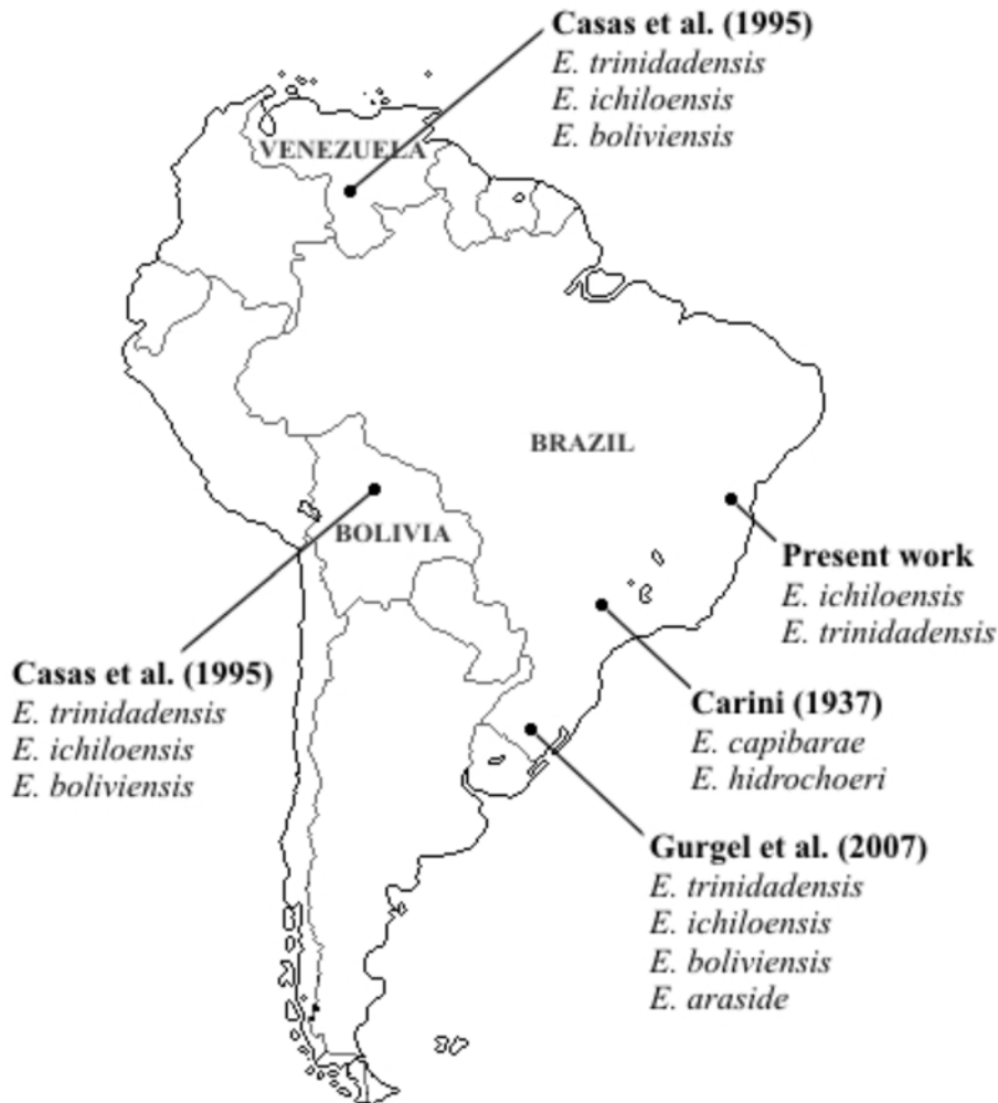
Fig.3. Map of South America, showing 5 localities where eimerid coccidia recovered from capybaras, Hydrochoerus hydrochaeris were described. In each locality references of each coccidian species previously reported are indicated.

Type Host: Hydrochoerus hydrochaeris Linnaeus, 1766 (Rodentia: Hydrochaeridae).